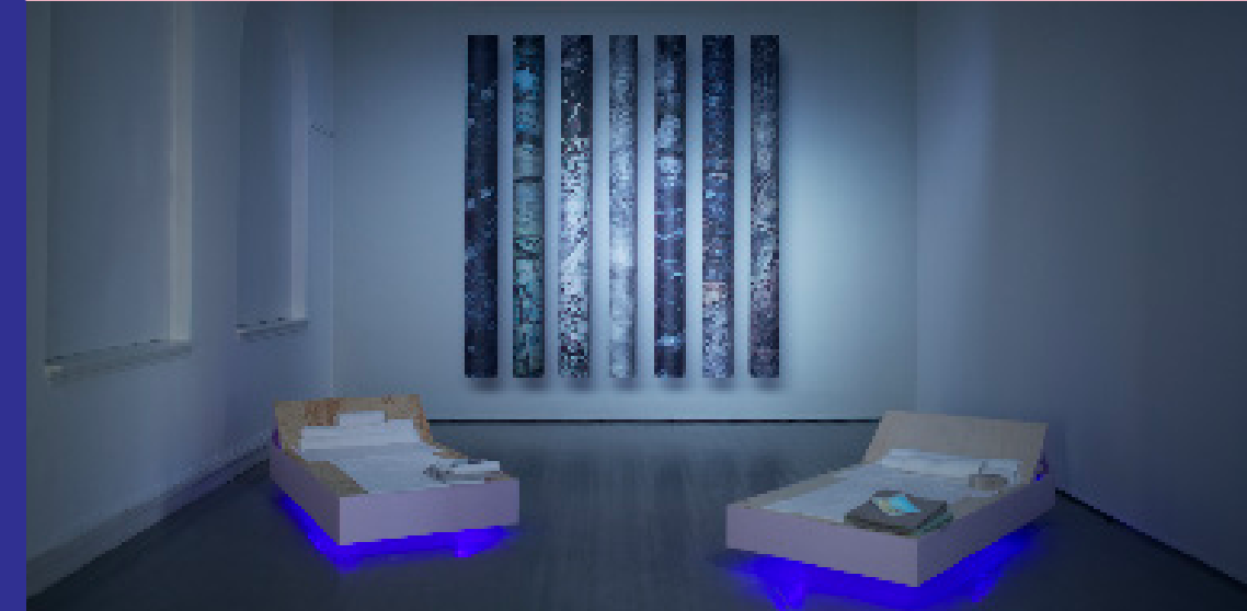
Courtesy of New Mineral Collective (Tanya Busse & Emilija Škarnulytė) and Vsevolodas Kovalevskis and Tromsø Kunstforening.