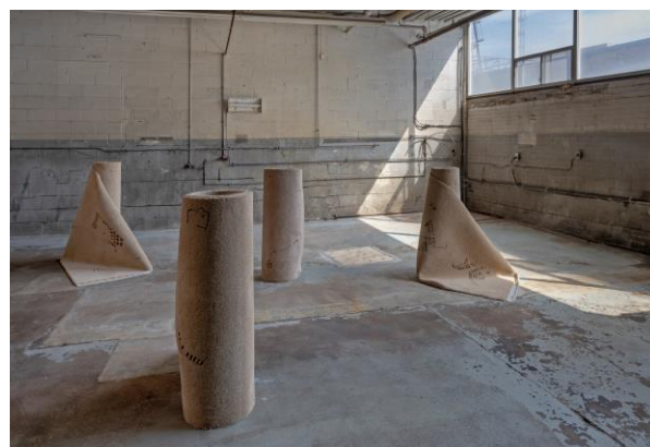
Hera Büyüktaşçıyan, Reveries of an Underground Forest , 2019. On view at 259 Lake Shore Blvd East, Toronto.

Toronto, Canada, September 20, 2019 —The Toronto Biennial of Art (the Biennial) announced today that Abel Rodríguez (on view at Small Arms Inspection Building in Mississauga) is the recipient of its inaugural Art Prize, which recognizes an artist's outstanding contribution to the Biennial, and Hera Büyüktaşçıyan (on view at 259 Lake Shore Blvd East in Toronto) is the recipient of its first Emerging Artist Prize, which acknowledges a promising, early-career Biennial artist. Both awards carry a value of $20,000 CAD. Artists Althea Thauberger + Kite received an Honourable Mention ($5,000 CAD). Awardees participating in the Biennial's first-ever edition, The Shoreline Dilemma , were selected by an international jury of distinguished art-world luminaries.